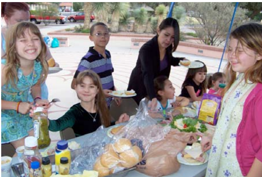
GSP kids "relished" eating lunch on the labyrinth before making their Advent wreaths. See the story on Page 7.